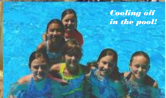
Cooling off in the pool!