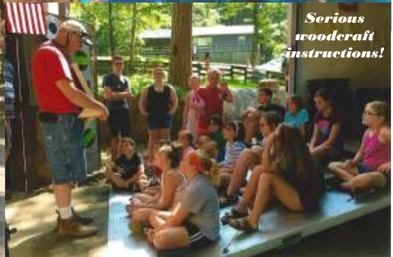
Serious woodcraft instructions!