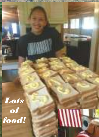
Lots of food!